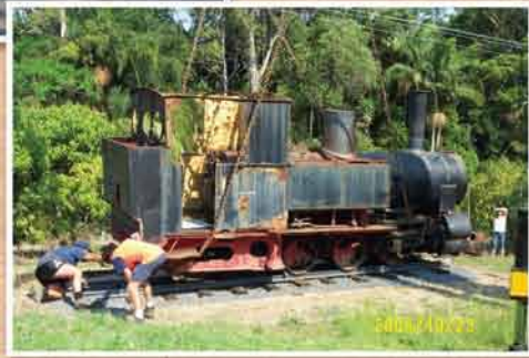
Loco placed on tracks Wises Farm