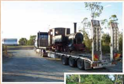
Leaving Murrumba Downs

A donation of any size can make a real difference.